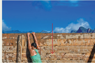
Leaving the Frame

In this example, the athlete is either about to jump or just finished. Either way, the main action is not happening inside the frame.