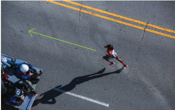
Entering the Frame

Moving objects should enter, not exit the frame. The human eye will try to follow the supposed path of a moving subject. If the subject is moving out of the frame, it feels as if the photograph is incomplete.